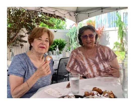
Page 3 of 8