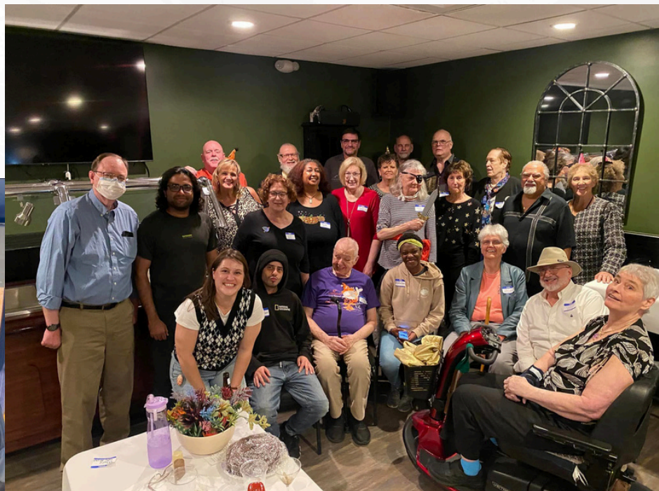
Boston Beanstalks Tall Club Anniversary, Scholarship Fundraiser and Halloween Event. October 2024