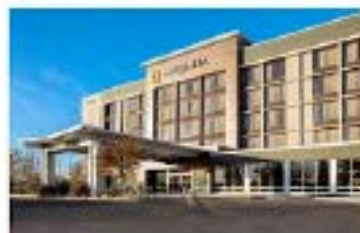
Close to HWY 50 & Light Rail

1-855-267-3149 (As of February 2025, Rates Range from $130 - $150 per night)