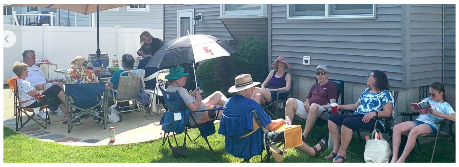
Page 5 of 8